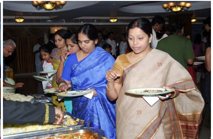
Members and their families enjoying the Fellowship at NKM Grand after the public meeting