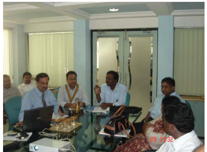
Members discussing with DG on club plans during the Club Assembly at Pashu's office