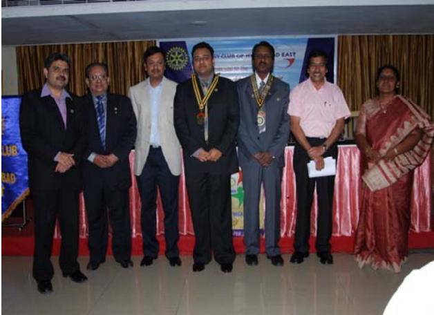
Induction of New Members to our club