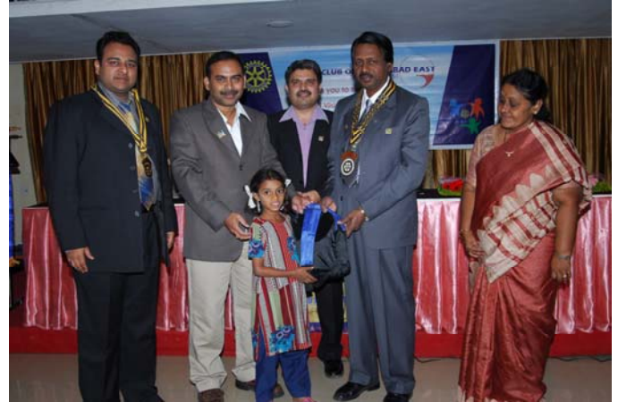
Micro project of funding one year's education material for an underprivileged child