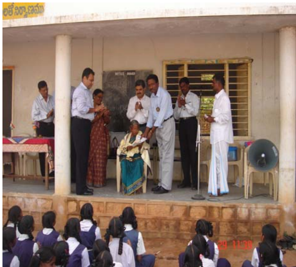
DG presenting Vocational Excellence Awards to the Government employees of Rajendranagar Mandal