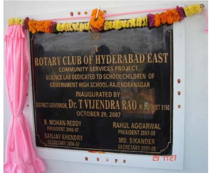
Name plate reading outside the science lab